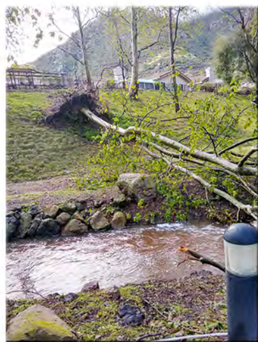
A large tree was uprooted near the lower end of the Nature Park and fell across the creek; another lost it's top at the upper end. That one destroyed a number of roof tiles and a sizable portion of the fence. This was the 2<sup>nd</sup> time the same tree had lost part of its top; the tree has now been removed.